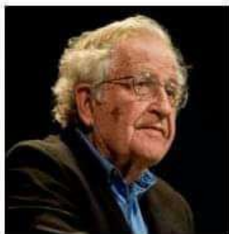
Dr. Noam Chomsky

Philosopher, Political Activist & The Father of Modern Linguistics