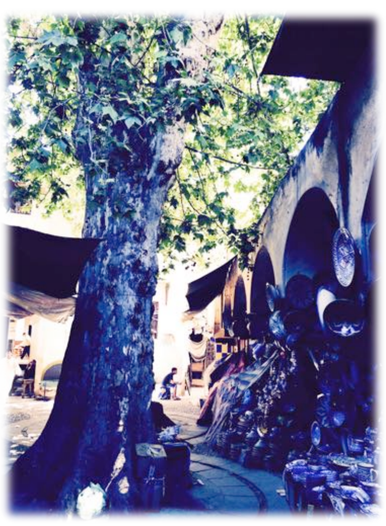
Contemporary place of Maristane Sidi Frej, Médina Fès, Marocco

This symposium is, indeed, intended to integrate all aspects of mental illness. It will bring together the various stakeholders: psychologists, psychiatrists, neurologists, sociologists, social workers and general practitioners. This dialogue will take place in plenary session with the aim of finding a common and